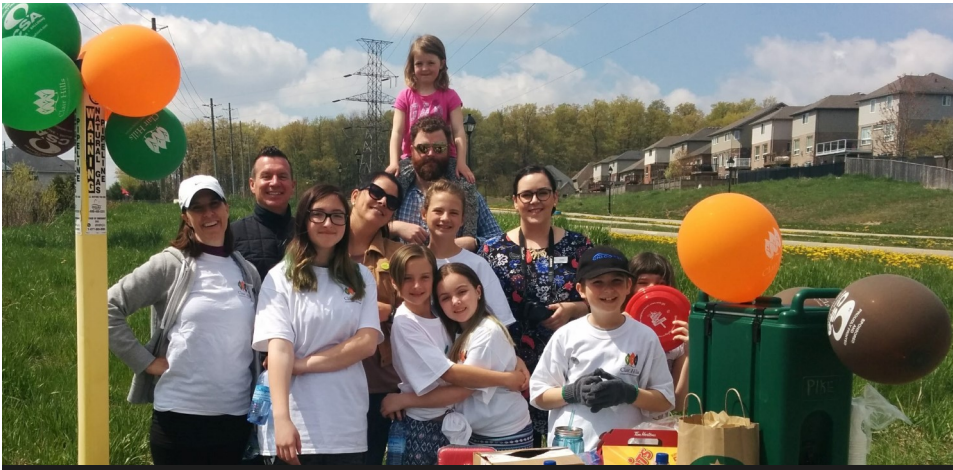
Volunteers all ready to clean up the neighbourhood at last year's Spring Clean Up.