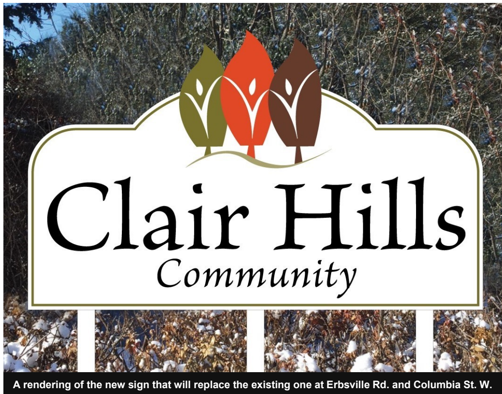
A rendering of the new sign that will replace the existing one at Erbsville Rd. and Columbia St. W.

The Clair Hills Community Association is also installing a community message board in St. Moritz Park. This message board will provide a new community space for us to promote our upcoming events and share important neighbourhood information.