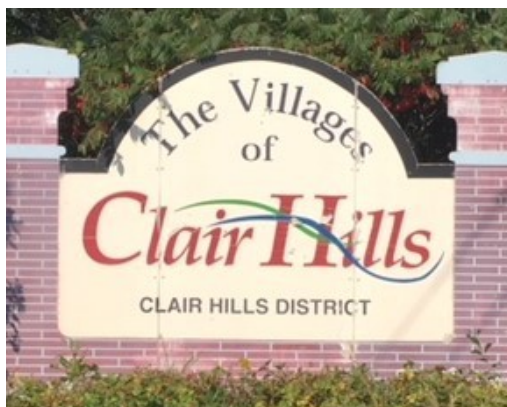
Time to replace the builders' cardboard sign!

Project funding was made possible in part by the City of Waterloo and United Way Waterloo Region Communities through the City of Waterloo Neighbourhood Matching Fund.