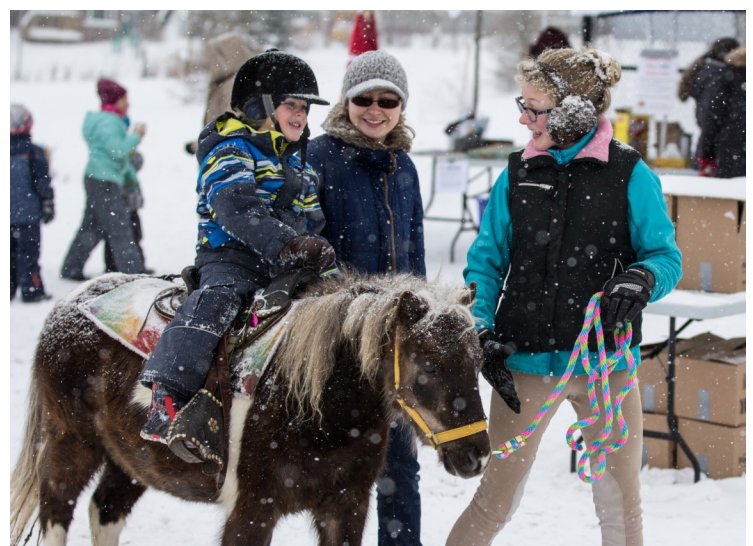
A Horseback Adventures guide makes sure everyone is having fun!