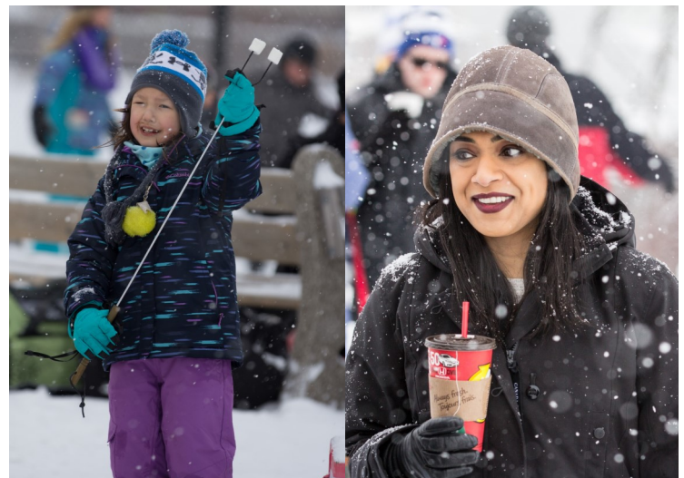
Left: Getting ready to roast marshmallows by the fire!