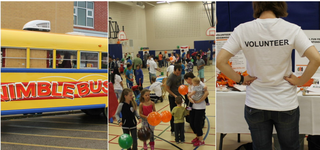
Fall Fun Fest is Saturday September 17! Join us for fun and entertainment. Read more on page 2.

Sincerely, The Clair Hills Community Association Board of Directors and Volunteers