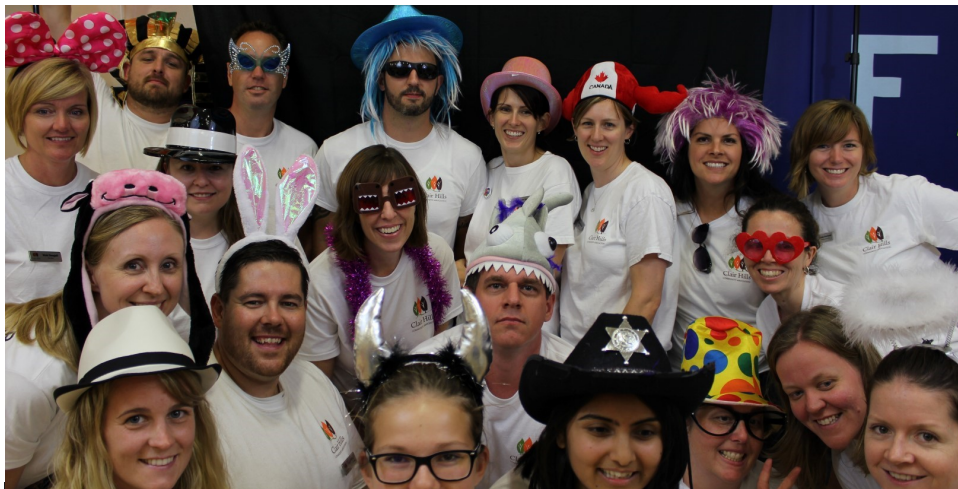
Say Cheese! The hilarious photo booth is back at this year's Fall Fun Fest on September 17.