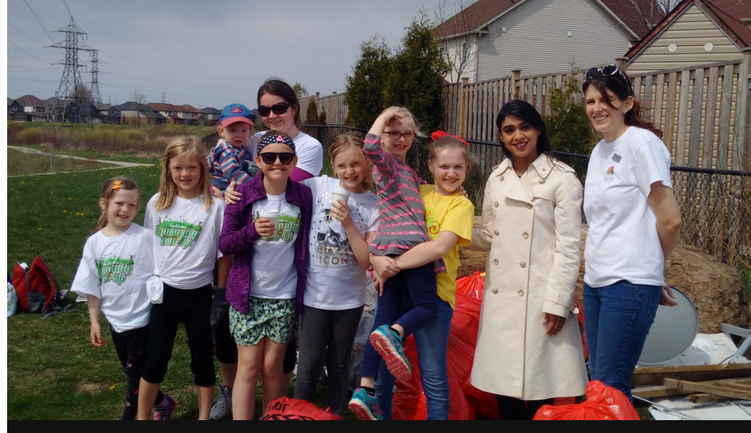
Make Clair Hills Beautiful. Read more about our upcoming Spring Clean Up on page 2.