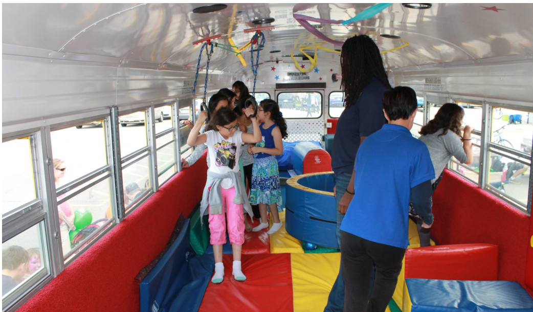
We've got lots of fun and entertainment for this year's Fall Fun Fest. Read more on page 2.

It's important we have regular commitment from our volunteers for this activity. Please email rink@clair-hills.ca to join our Ice Rink Maintenance team.