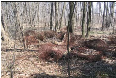
Rolls and rolls of barbed wire found in the woodlot behind the park on Lausanne Cres.