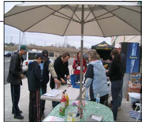
Serving up sausages with a light dusting of rain at the Canadian Tire Grand Opening.