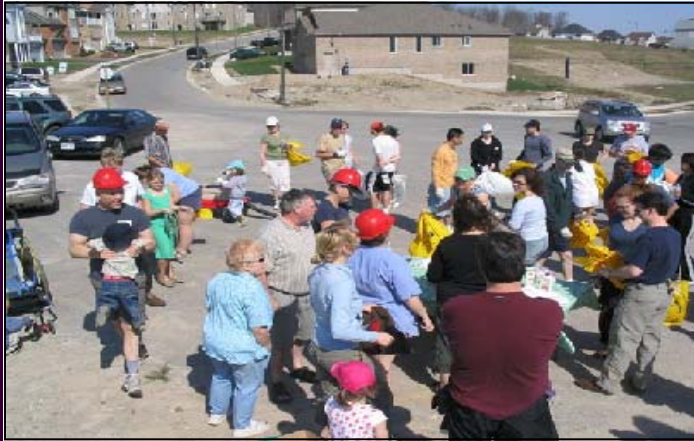
Volunteers at the top of Columbia, ready to divide and conquer!

“When you do nothing you feel overwhelmed and powerless. But when you get involved you feel a sense of hope and accomplishment that comes from knowing you are working to make things better.” —Anonymous.