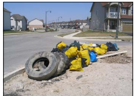
Tractor tires, pipes and garbage left at Brandenburg Court for pick-up.