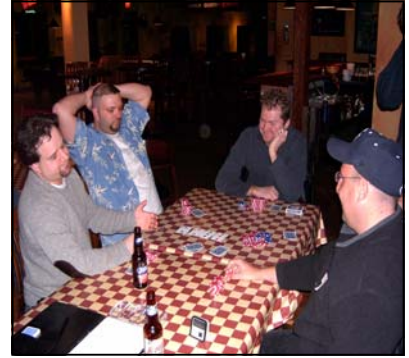
Disbelief at the Clair Hills Poker Tournament

Everybody had such a great time! And best of all, we raised $675 for the playground at our new school! Thanks to everyone who came out! Special thanks to East Side Mario's for hosting such a great event!