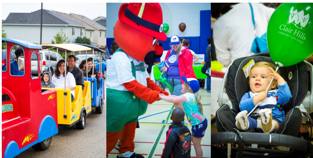
Fall Fun Fest is Saturday September 16! Join us for fun and entertainment. Read more on page 2.