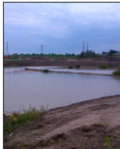
Clair Hills is growing again. Read more about the St. Moritz park on page 3.