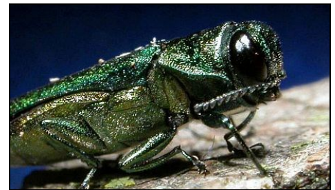
The potential damage of this insect rivals that of Chestnut blight and Dutch Elm Disease.

The cities of Waterloo, Cambridge and Kitchener, the townships of North Dumfries, Wellesley, Wilmot and Woolwich, the Grand River Conservation Authority and the Canadian Food Inspection Agency are working together to implement measures to help slow the spread of this pest.