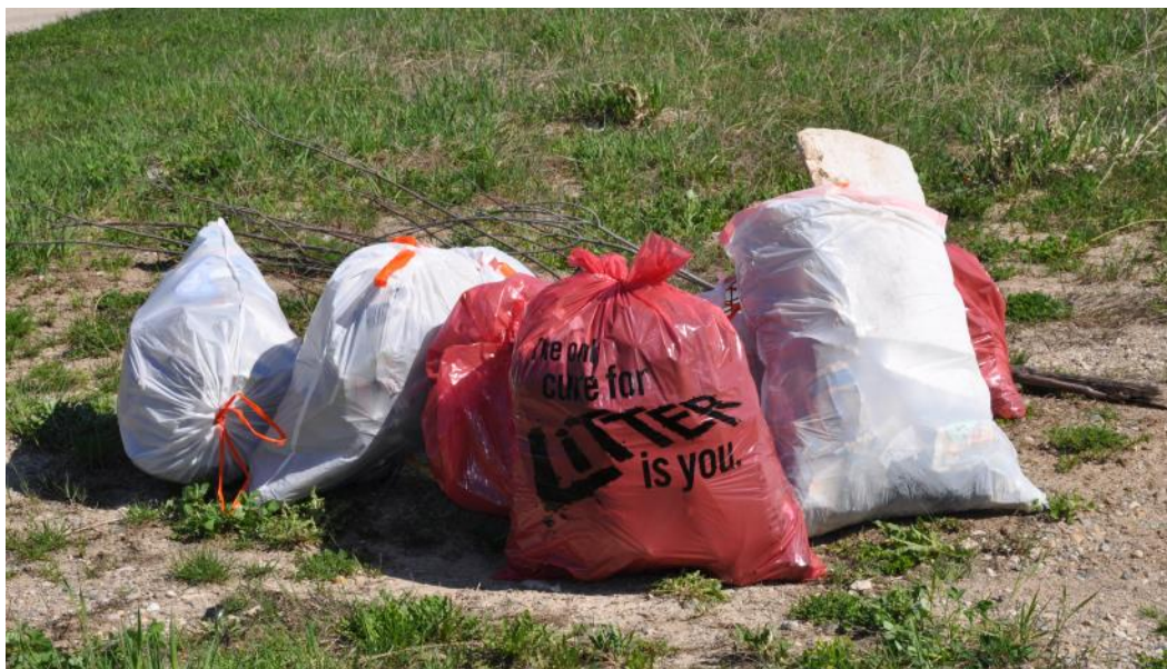
The annual Spring Clean Up is May 10. Help keep Clair Hills beautiful. Learn more on Page 2.