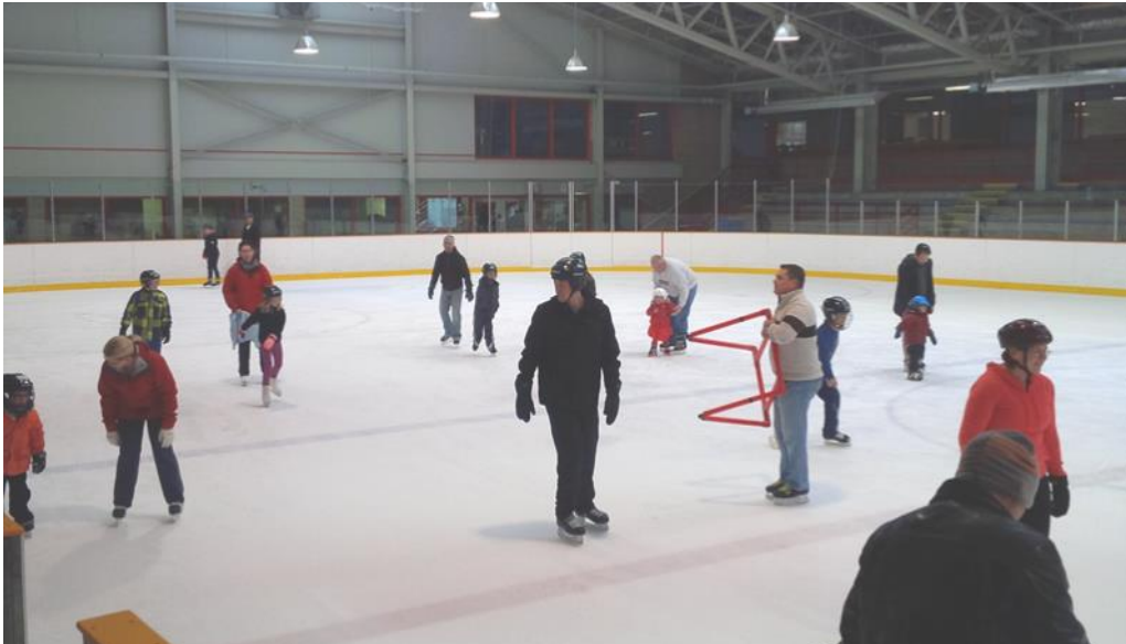
Residents of Clair Hills enjoyed a free skate on March 28, 2014.