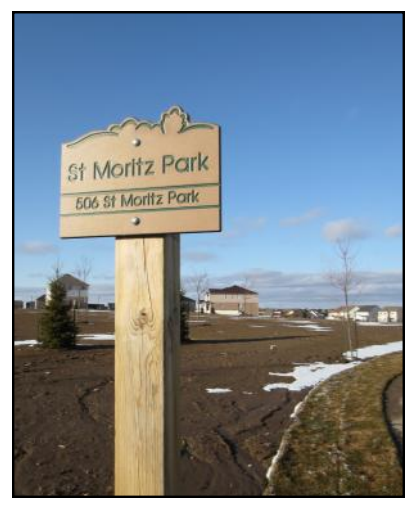
The St. Moritz Park public consultation is April 23rd. Learn more on page 3.